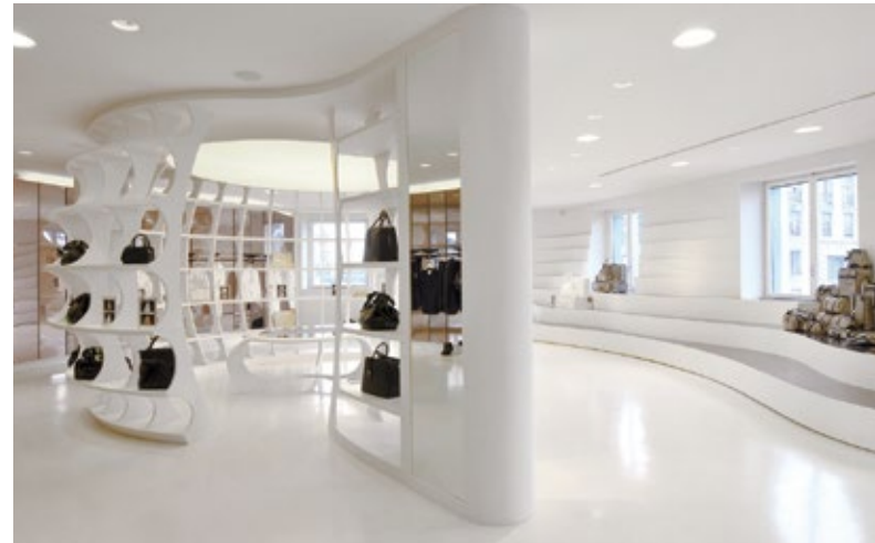
Project: Showroom ALV, Italy - Fabrication: Flusso, Facchinetti Group - Photo: Valter Baldan Fotografo