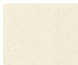
Crystal Beige G101 [12 mm]