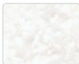
Arctic Granite G34 [12/9/6 mm]