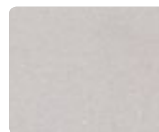
Kreemy Grey P101 [12 mm]