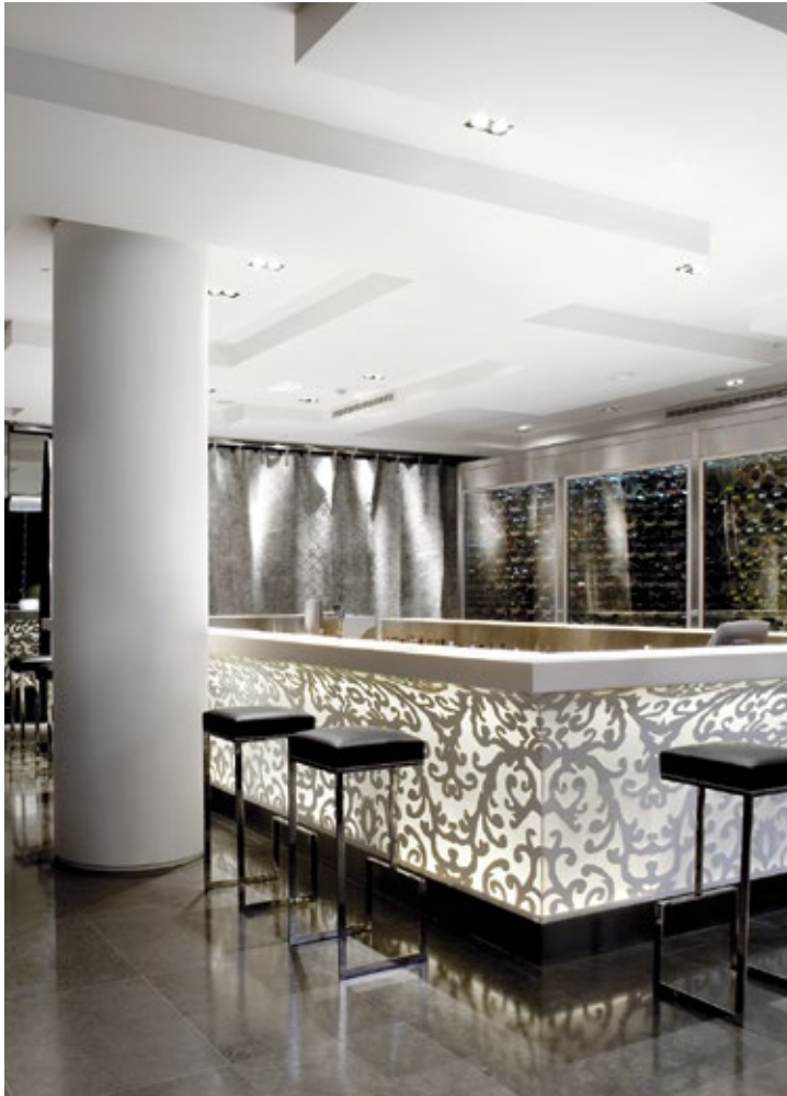
Project: Hotel Puerta America, Spain - Design: Maison Liaigre